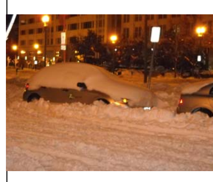
New Jersey Avenue in front of Hyatt in DC

fice buildings that my group thought I had taken leave of my senses when I stopped to take a picture of an empty hallway. When asked why I explained that in the many years I have been coming to DC this is the first time that I have seen a hallway completely void of people! Wednesday was pretty well spent sitting in the hotel looking out the window at blizzard conditions that took visibility down to zero at times.